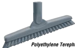
Polyethylene Terephthalate (PET)