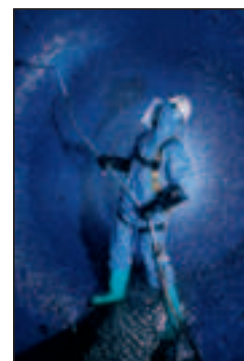
A60 Bloodborne Pathogen & Chemical Splash Protection

See page 3 for symbol legend. Call for current pricing.