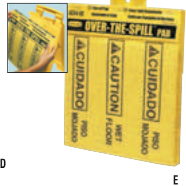
Model with keyhole slots shown.