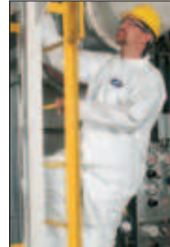
A40 Liquid & Particle Protection