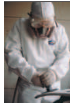
A30 Breathable Splash & Particle Protection