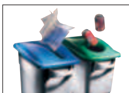
Tops also fit RCP 3541 and RCP 3554 (sold separately).