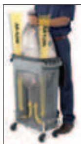
Venting channels make it easier to lift full can liners from the container.