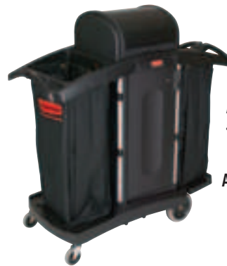
Includes locking security hood.