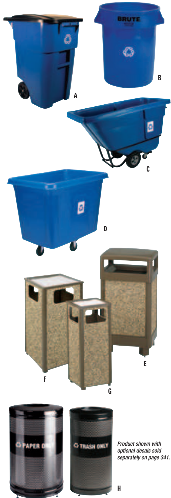
Product shown with optional decals sold separately on page 341.