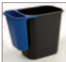
Wastebasket and recycling side bin each sold separately.