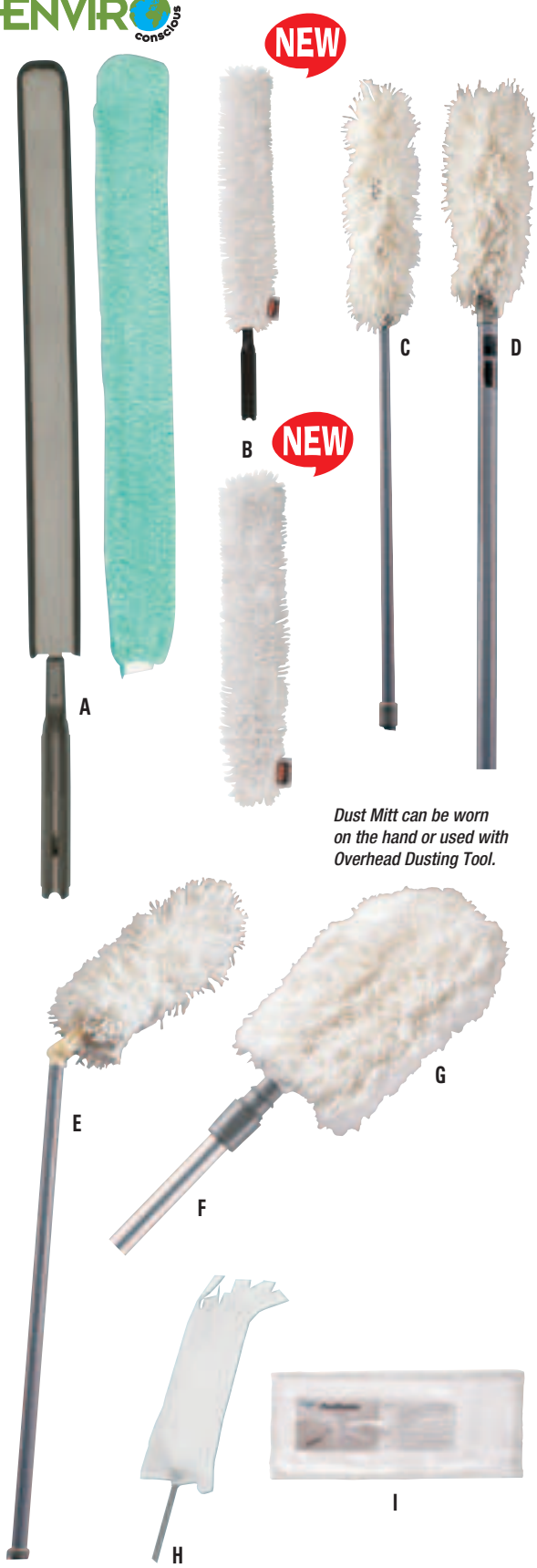
Dust Mitt can be worn on the hand or used with Overhead Dusting Tool.