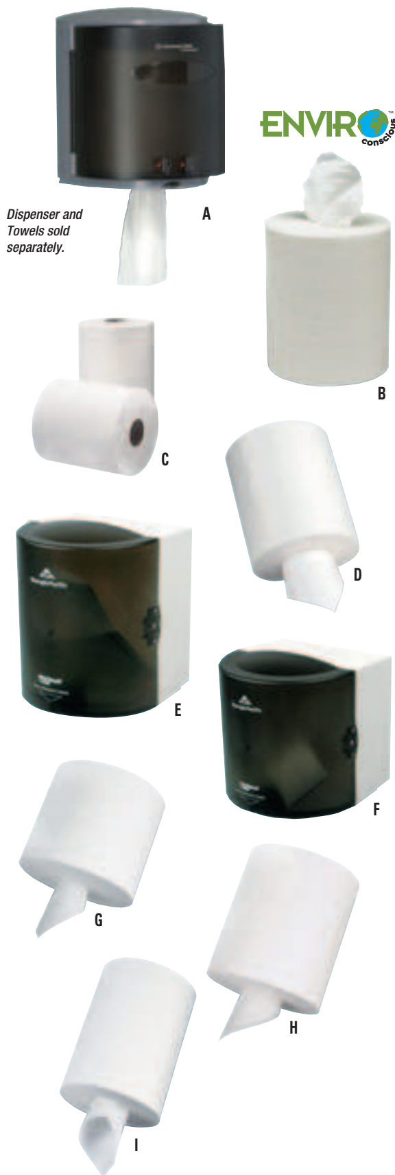
Dispenser and Towels sold separately.