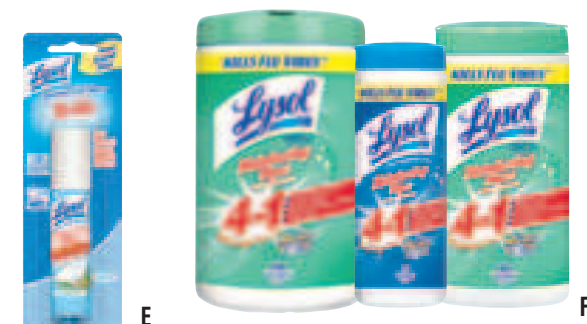
Protection on the go! E F