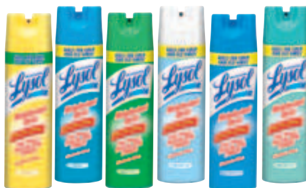
The first disinfectant spray proven effective against the highly contagious norovirus ("stomach flu"). A