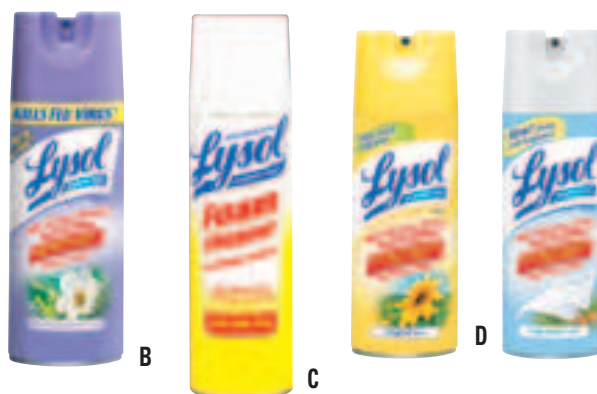
B C D