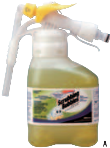
A New Ready-to-Dispense maintenance-free dilution control system.